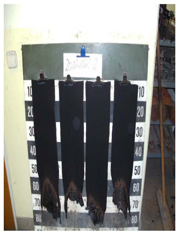
Appearance of sample B after the "Brandschacht" test