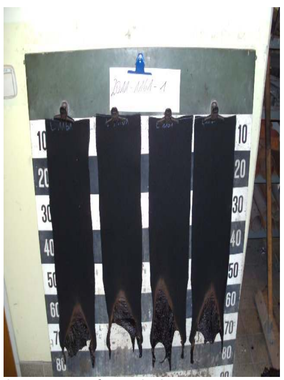
Appearance of sample A after the "Brandschacht "test