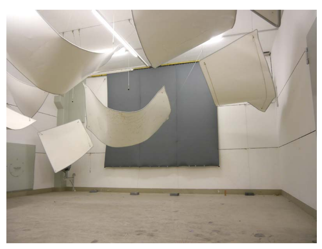
Figure B1. Flat arrangement, test object mounted in the reverberation room.