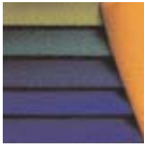
Gaja - new colours