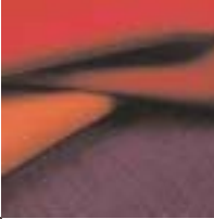
Trevira CS - upholstery fabrics