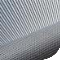
Newspaper - a graphic play

The lightest end of the colour range has been replaced by the "black pastels" and now consists of dusty, retrospective colours with a characteristic and personal grey tone.